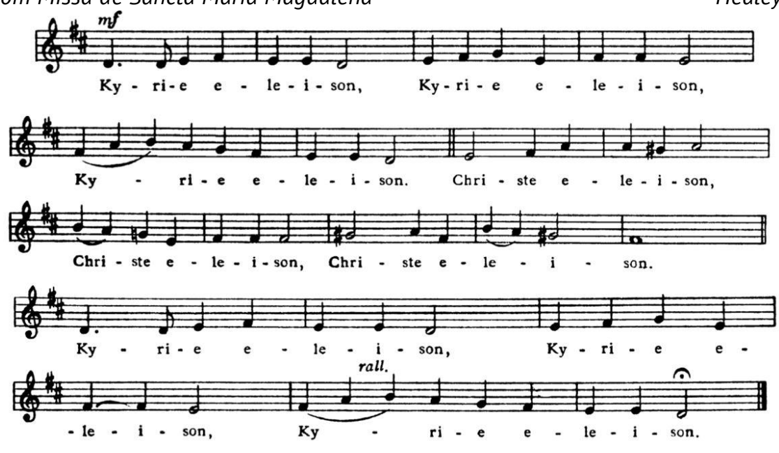
Lord, have mercy. Christ, have mercy. Lord, have mercy.