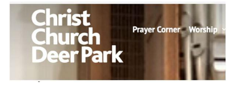
Click here to go the Prayer Corner or Go to the website

"Our prayer corner is now open for prayer! On our website, you will find a quiet space to reflect on each liturgical season and a space to pray for one another online. Listen to a beautiful piece of music to inspire praise, read a passage from scripture to nourish your soul, reflect on an art piece to connect you with our Creator, and pray to the One who made you."