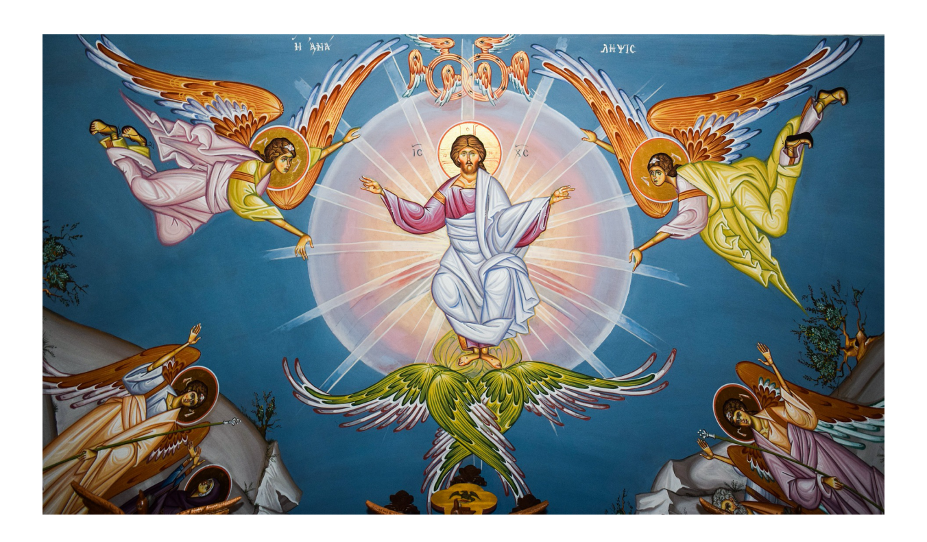
"Behold, I am with you always, until the end of the age."