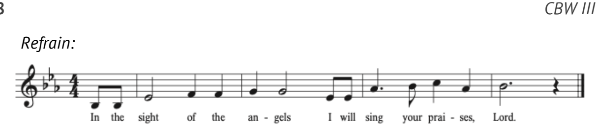
I thank you, Lord, with all my heart, You have heard the words of my mouth. In the presence of the angels I will bless you, I will adore before your holy temple. Refrain .

I thank you for your faithfulness and love Which excel all we ever knew of you. On the day I called, you answered; You increased the strength of my soul. Refrain .