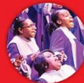
Toronto Mass Choir